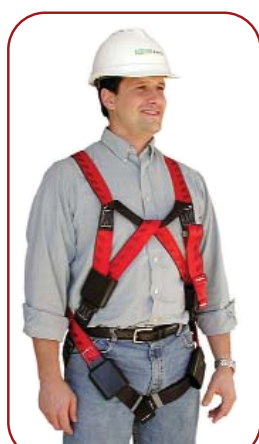
"No Metal Above the Waist" TechnaCurv Harness Part No. 10050125

Note: This Bulletin contains only a general description of the products shown. While uses and performance capabilities are described, under no circumstances shall the products be used by untrained or unqualified individuals and not until the product instructions including any warnings or cautions provided have been thoroughly read and understood. Only they contain the complete and detailed information concerning proper use and care of these products.